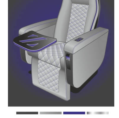
Illustration: Jan Seidl